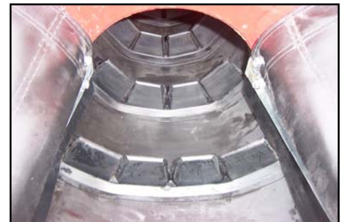
Patented Cleated Belt